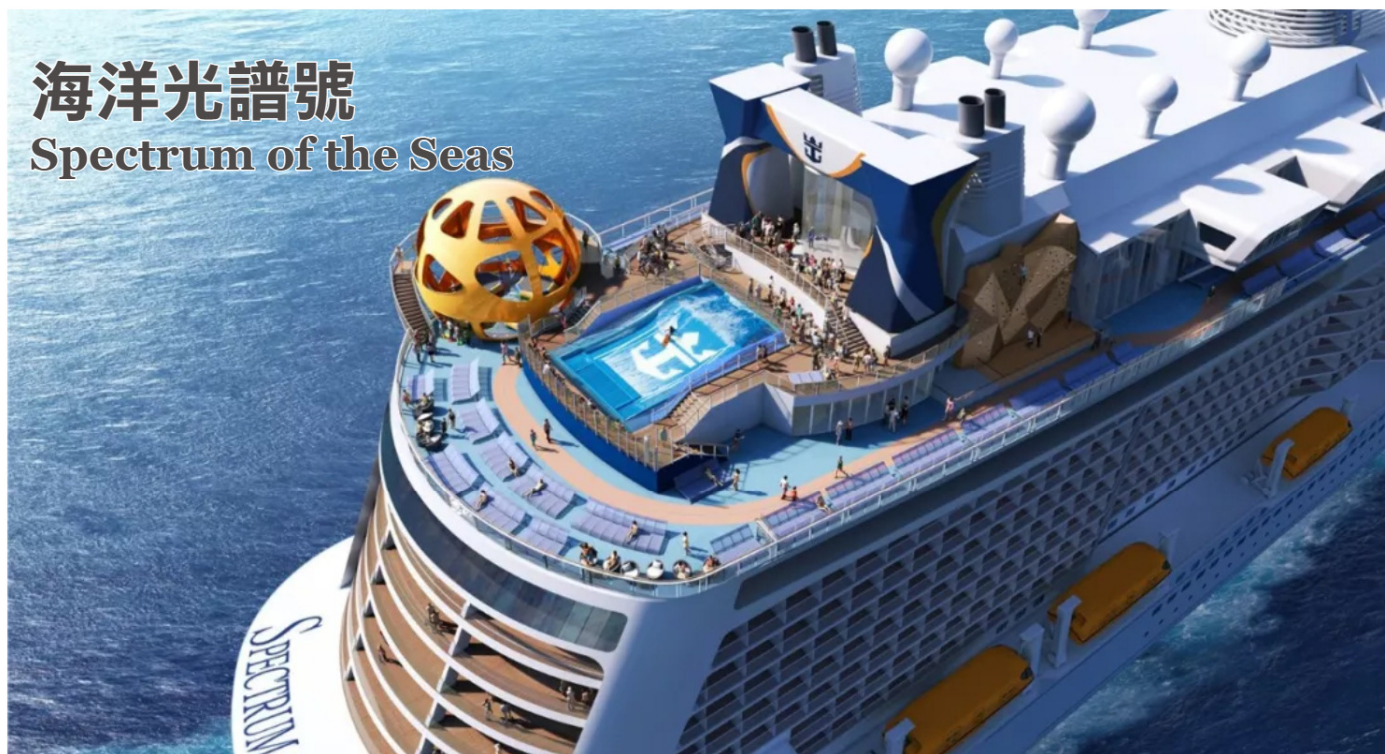
南極球 (Sky Pad)